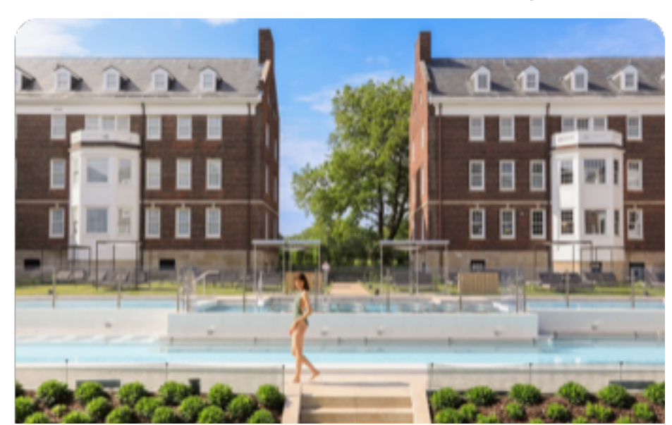
Tuesday 12:26 PM